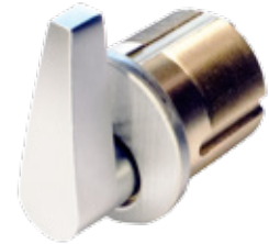
M100TA M118TA M114TA